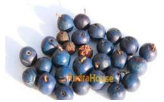
Figure No 3: Fruits of Elaeocaropus ganitrus

Fruits: Small round, or oval violet or blue colored and acidic in taste