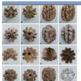
Figure No 5: Microscopy Parts of Elaeocaropus ganitrus

Leaves: single layered epidermis, compactly arranged parenchyma cells covered externally with a cuticle, palisade cell made up of two layers of elongated cells, compactly arranged chlorenchyma cells, prisms of calcium oxalates in midrib cells, conjoint, collateral and closed vascular bundles.